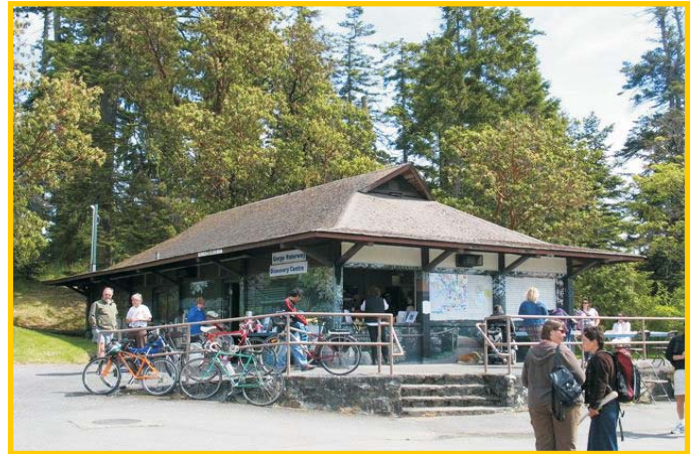
A new life for the former concession stand