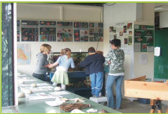
Come have fun with the critters in the Seaquarium touch tank