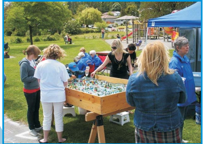
Learn about the Gorge Waterway with our interactive watershed model

For more information and bookings: phone: 250.380.7585 email: education@worldfish.org www.worldfish.org/gwdc.htm